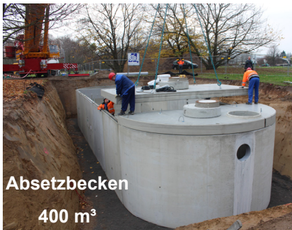
Absetzbecken 400 m 3