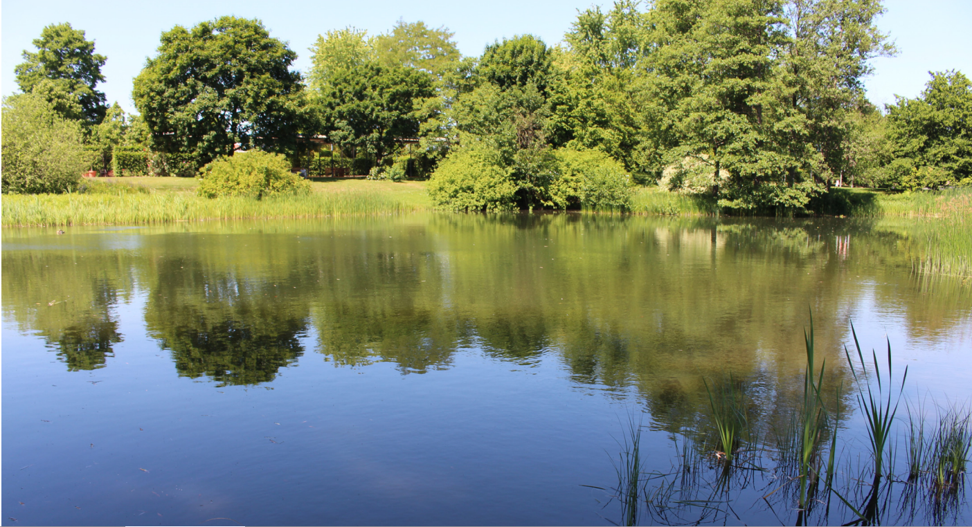
Britzer Garten Area I + II, Berlin – Germany

Location: Berlin – Germany Project: “Regenwasserbewirtschaftung im Britzer Garten”; Detailed Design 2012-15 Size: 80 ha (Former BUGA-Area)